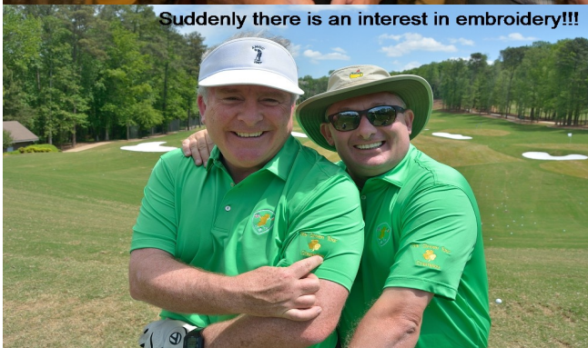
Suddenly there is an interest in embroidery!!!