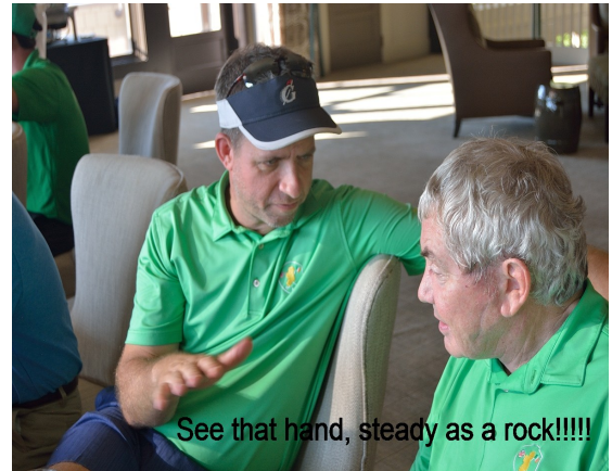
See that hand, steady as a rock!!!!