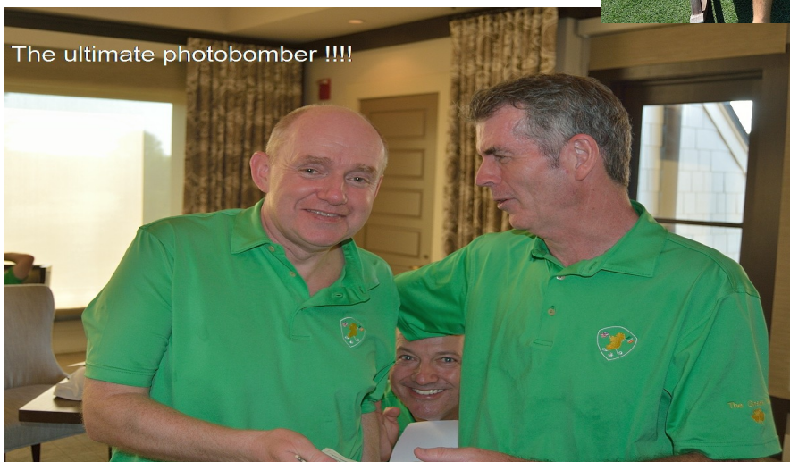
The ultimate photobomber !!!!