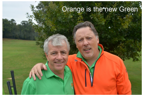
Orange is the new Green